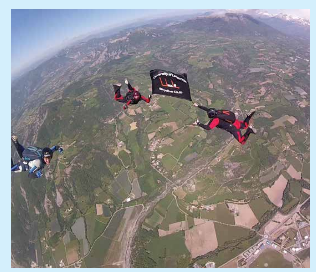
UL Skydiving Club - France